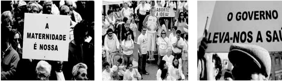
FIGURE 3: POPULAR OPPOSITION TO THE CLOSURE OF MATERNITY WARDS