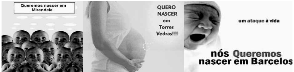
FIGURE 5: EXPRESSIONS OF IDENTITY OPPOSING TO THE CLOSURE OF MATERNITY WARDS