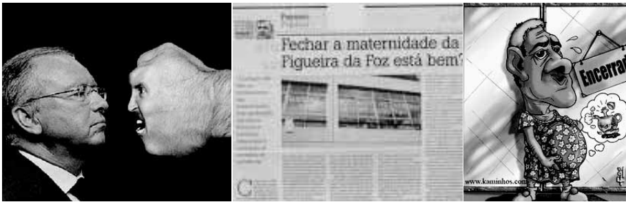
FIGURE 6: RESS IMAGES ON THE CONTROVERSY

As one of the great responsible actors for shaping public opinion, the media assumed an extraordinary relevance in this controversy, especially by playing the mediation role between the politicians and protest movements (Koopmans, 2004). Due to the absence of direct dialogue between involved actors in the controversy, the media served as a privileged communication channel of the arguments on both sides.