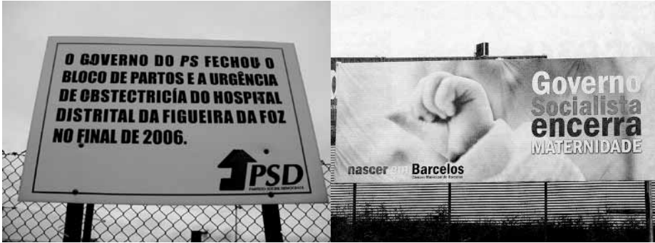
FIGURE 4: EXPRESSIONS OF POLITICAL OPPOSITION (POLITICAL PARTIES) TO THE CLOSURE OF MATERNITY WARDS